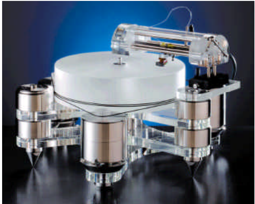
Clearaudio Master Reference Playback System

My first thought was to alternate my choice for an ultimate system with one nearly as good but dramatically less pricey, one centered around Magnepan's stratospherically good MG-20.1, itself one-tenth as dear as