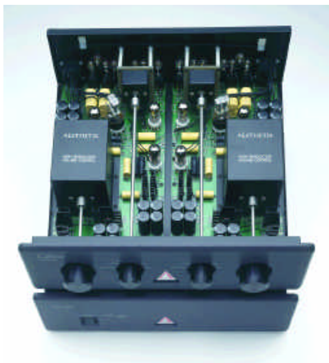
Aesthetix Callisto Line Stage

pages and I am going to refer you to back issues if you want to explore their "sound" at some length. At last, there are competitors coming up from the rear to challenge some of the Burmester's king-of-the-mountain status. The humbly priced Gamut CD-1 player, while no Burmester killer, does have a greater truth and musicality in the middle frequencies, suggesting that an update ought to be in the makings, whether it is or not at the German factory. I, for one, won-